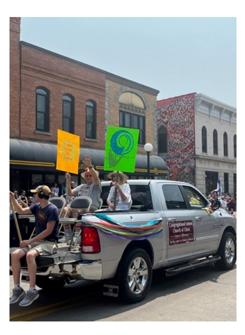
Here comes the truck!