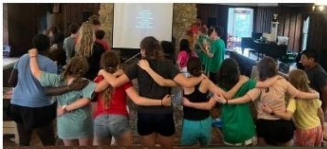
left: sing-alongs at Stronghold

Pride & Church Family picnic: Thank you to all who participated in the parade and picnic. It was a hot parade and cool picnic inside—a good and bonding time for our church community!