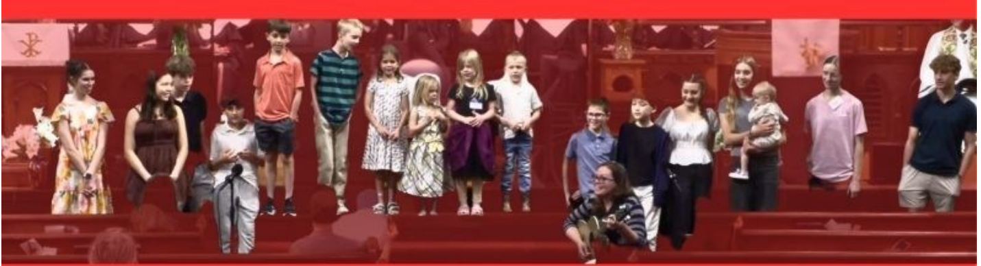
Congregational UCC Iowa City Christian Education